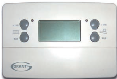
Wall-mounted twin-channel programmer