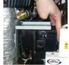
Reset button on wall hung boiler