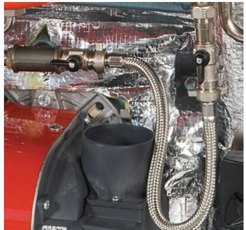
Filling loop fitted in boiler

Your installer should show you how to top up the system using the filling loop, either located in the boiler or on the system pipework. Topping up will be necessary for example when a radiator has been removed for decorating or air is bled from a radiator. Frequent topping up may indicate that there is a leak in the heating system or in one of its components. Contact your installer or service engineer to rectify the problem. Frequent topping up without tracing or rectifying the cause may result in internal damage to the boiler and its components, which would not be covered under the manufacturer's warranty.