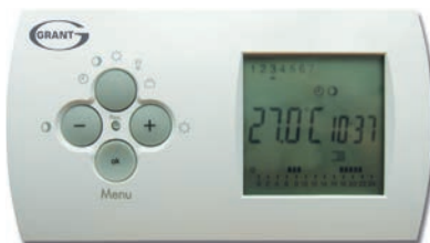
Wireless twin-channel programmable thermostat