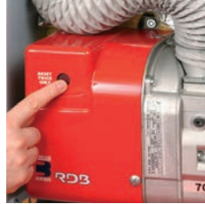
Reset button on floor standing boiler

If the burner fails to operate, check to see if the reset button (lock-out button on the burner) is illuminated. Internal wall hung models have a lock-out lamp on the control panel. If illuminated press the rest button on the burner control box. The reset button should not be pressed more than twice, should a burner lock-out occur. If the burner cannot be reset, first check that you have oil in the tank and also that your fire valve has not tripped. Please refer to page 11. If the problem still exists then contact your installer or service engineer for assistance.