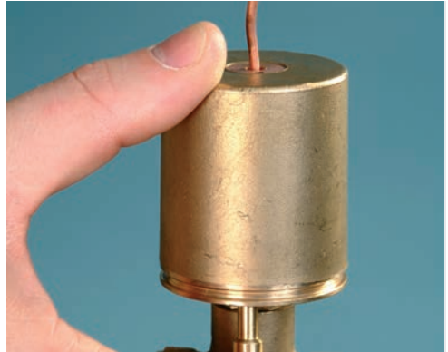
Remote acting fire valve